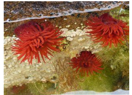
8Copyright Alec Ohnstad

http://www.scotland.gov.uk/Topics/marine/marine-consultation/events